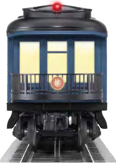
Curved end platform deck and light on observation car

Add as many extra coach cars as you like to your scale Polar Express consist. This car has the same features as the Polar Express coach in the two-pack above. True to the movie, there are no figures included in this add-on car. 6-25578 $199.99