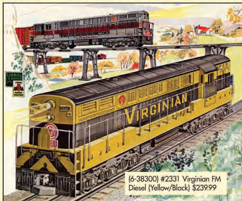
(6-38300) #2331 Virginian FM Diesel (Yellow/Black) $239.99

Also available for separate-sale! The Virginian FM in stunning yellow and black. This locomotive is equipped with the same great features as the Lackawanna FM in the Thunderbird set.