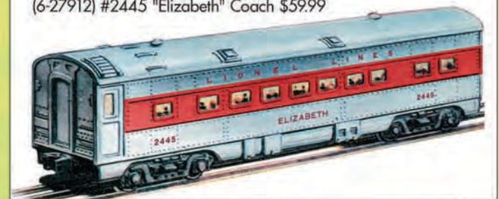
(6-27912) #2445 "Elizabeth" Coach $59.99