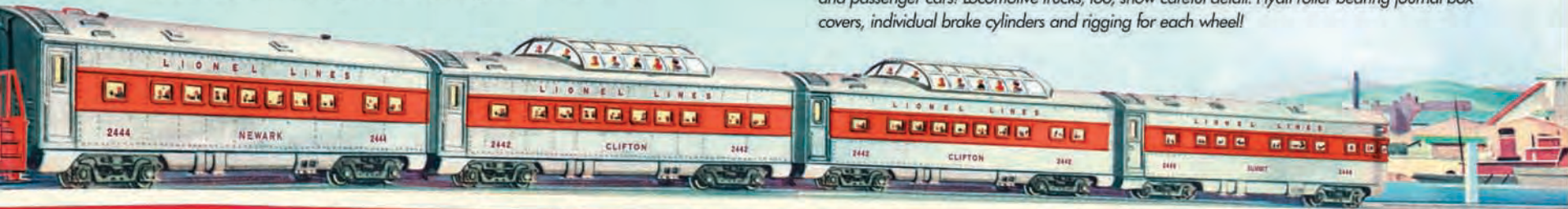
(6-31775) #1562 Burlington GP-7 Passenger Set $469.99

You've never seen such complete details as you'll find on this 1 1/2 inch long scale-detailed reproduction of General Motors' 1500-horsepower Diesel-electric GP-7! Every single surface detail has been included: sand box covers at both ends of the roof, fans and fan motors for the engine stacks and even the exhaust stack of the boiler used in the real GP-7 for heating cab and passenger cars! Locomotive trucks, too, show careful detail. Hyatt roller bearing journal box covers, individual brake cylinders and rigging for each wheel!