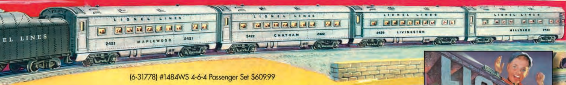
(6-31778) #1484WS 4-6-4 Passenger Set $609.99

You've never seen such complete details as you'll find on this 1 1/2 inch long scale-detailed reproduction of General Motors' 1500-horsepower Diesel-electric GP-7! Every single surface detail has been included: sand box covers at both ends of the roof, fans and fan motors for the engine stacks and even the exhaust stack of the boiler used in the real GP-7 for heating cab and passenger cars! Locomotive trucks, too, show careful detail. Hyatt roller bearing journal box covers, individual brake cylinders and rigging for each wheel!