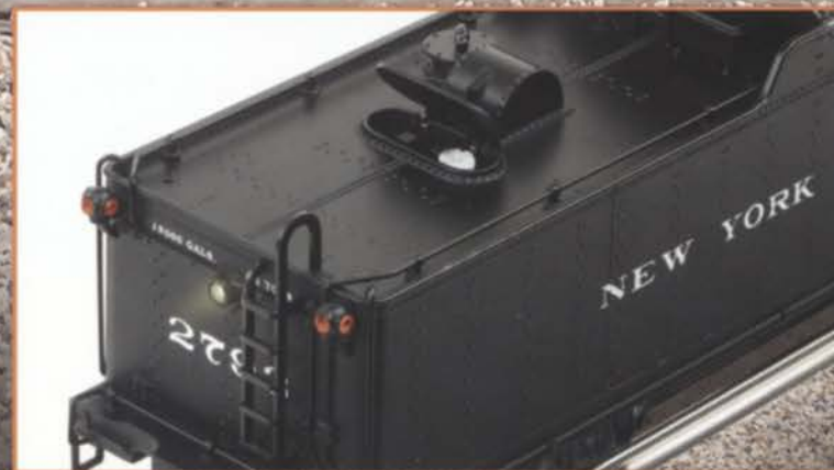
Authentic tender detailing with RailSounds controls under the water hatch