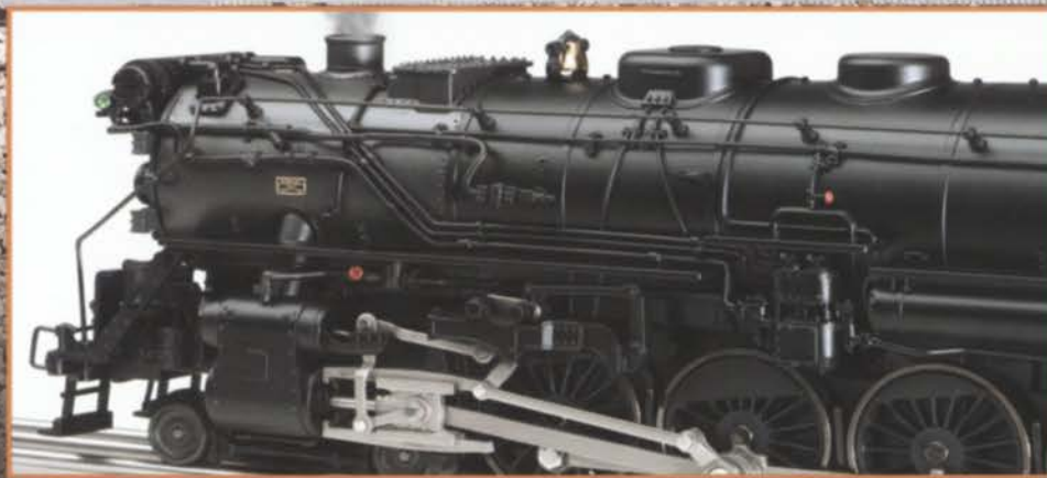
The Lionel New York Central L-2a Mohawk marks the debut of this impressive locomotive in die-cast O gauge